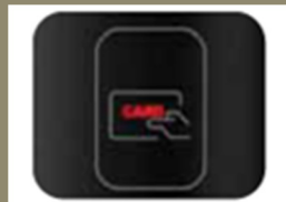
ID Badge Sensor